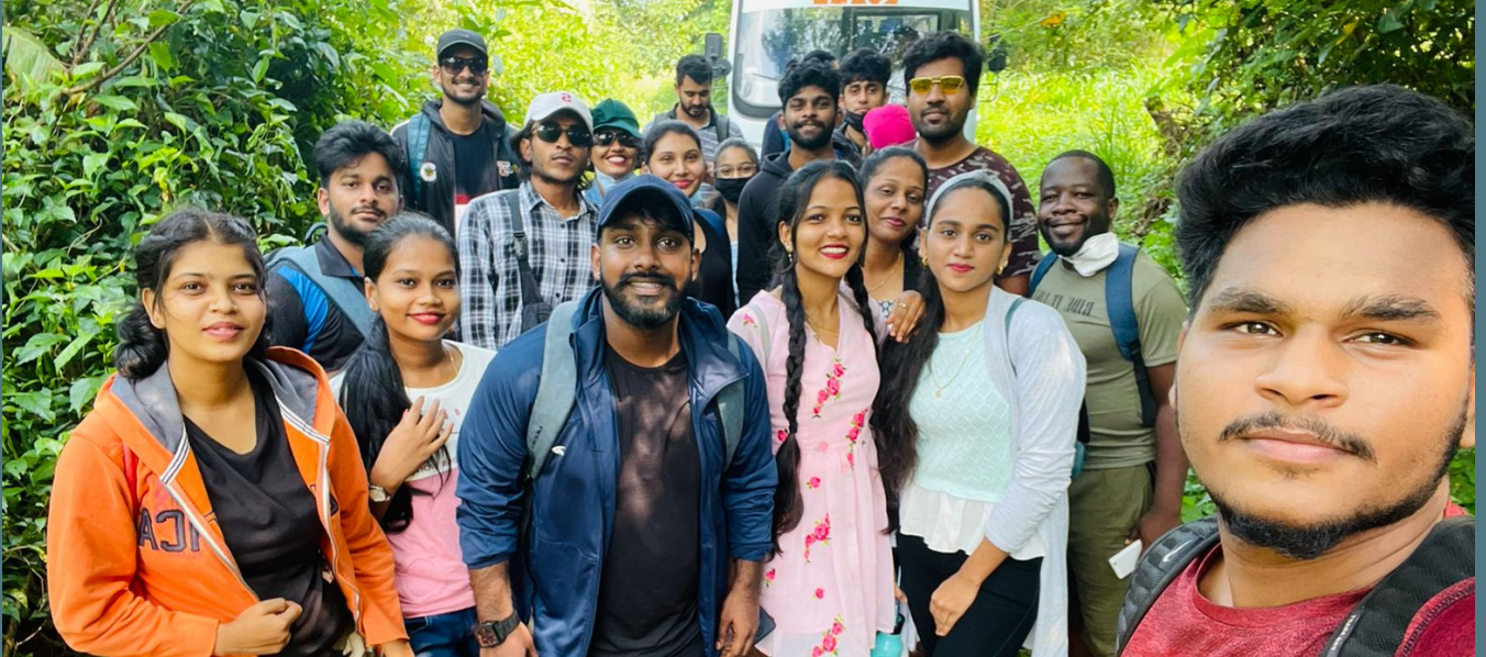
MTTM Department had a trek to a waterfall in South Goa.