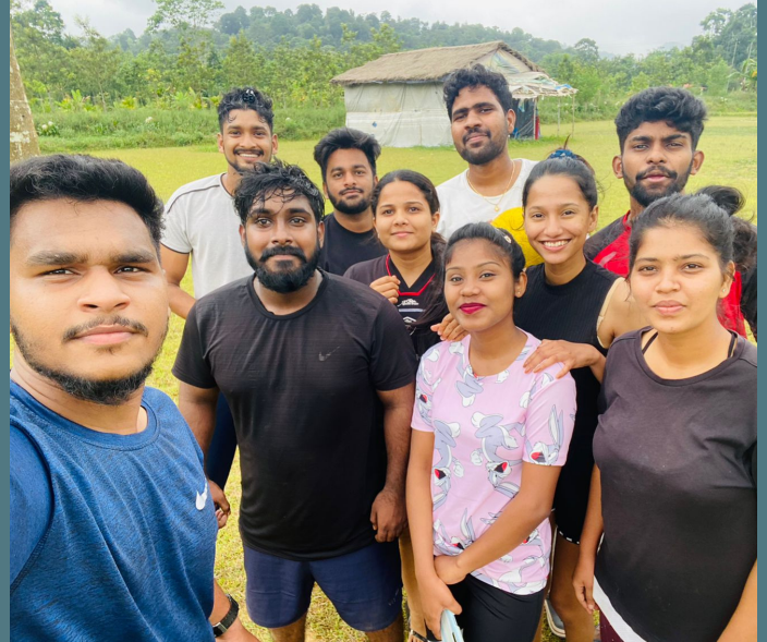
A selfie after a fun volleyball game in Coorg.