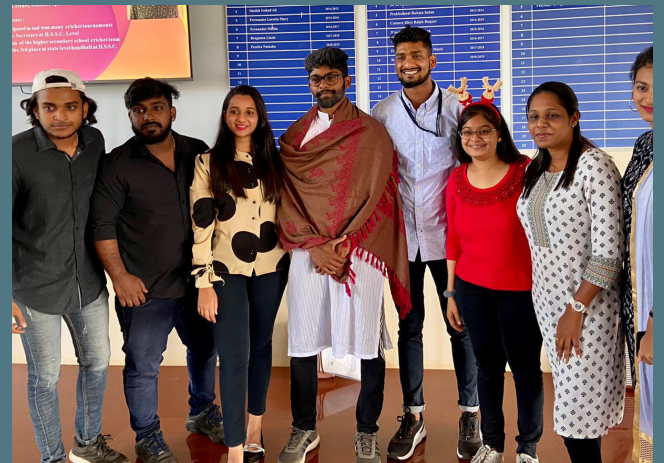
MTTM students winning 2nd place in Inter Department Christmas Play Competition.