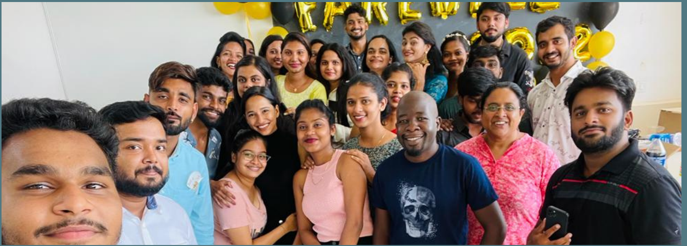
Freshers Party Organized by MTTM Part 1 for their seniors.