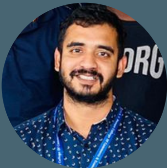
By Asst Professor Yash Prabhugaonkar

People use these natural spaces to cope with physical and mental health difficulties. Besides, feelings of home isolation are predicated by stay-at-home orders and social isolation. During the pandemic, people used these ecological ecosystems to participate in a wide range of activities, from exercise to bird watching, as these natural spaces helped reduce stress in a time of global chaos. Evidence shows that people have significantly increased their visitation rate to natural areas and urban forests. The United Nations General Assembly's Agenda 2030 action plan is directed toward humanity, our planet, and prosperity. UN member countries are also willing to transform this world into a more sustainable one by implementing goals and indicators designed to enable sustainable development through social, economic, and environmental aspects.