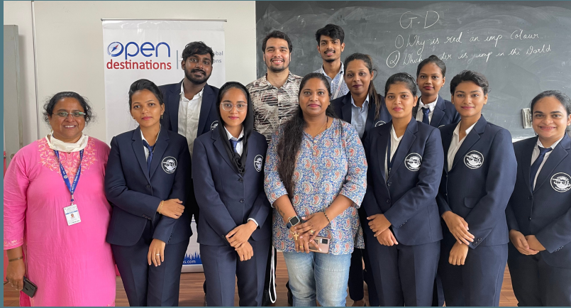
OPEN DESTINATIONS INFOTECH PVT LTD placement drive conducted for MTTM part 2 students.