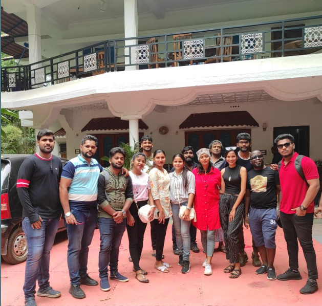
MTTM Department visited Coorg for their Study Tour.