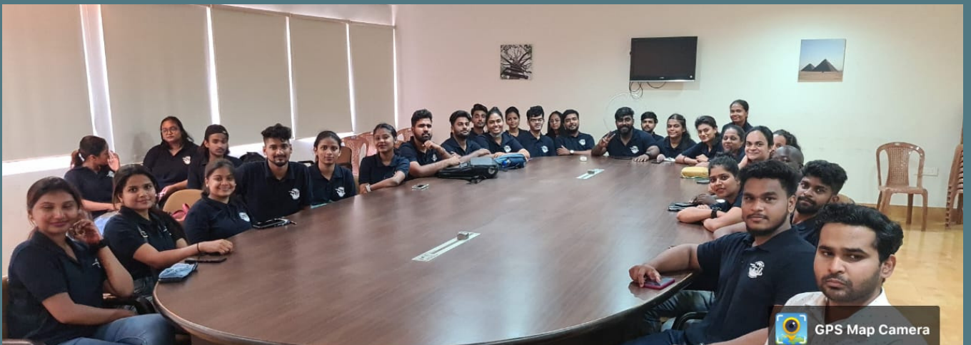
Department industrial visit to CIBA, Verna.