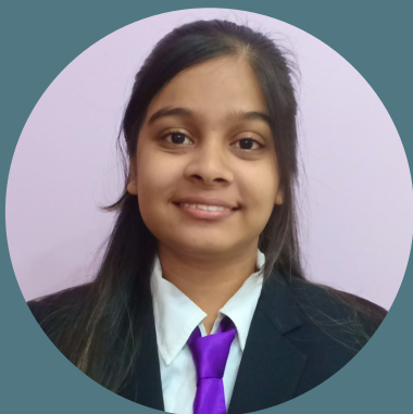
By Anica D'Souza (MTTM Part 1)

Make your list and witness everything From magnificent mountains To sandy beaches. Explore Villages and new cities, And I ensure you That you'll like the Taste of Travel.