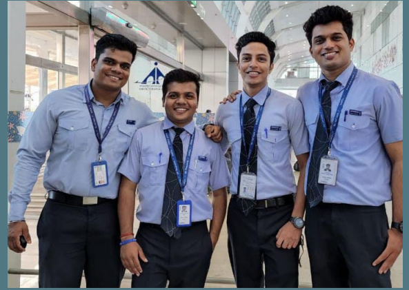
MTTM ex students working at Indigo airlines.