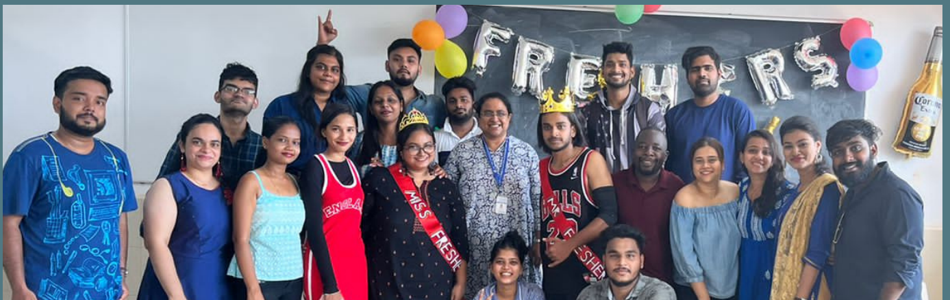
Freshers Party Organized by MTTM Part 2 students for their juniors.