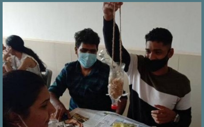
Students making a bird feeder out of waste.