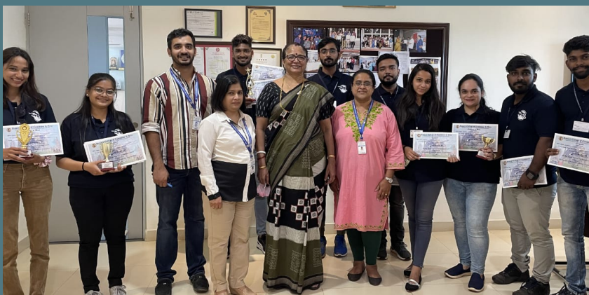
MTTM students winning trophies at various events in an intercollegiate event 'Entrada'.