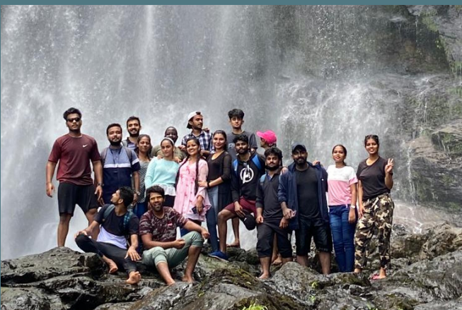
Trek to Netravali Waterfall